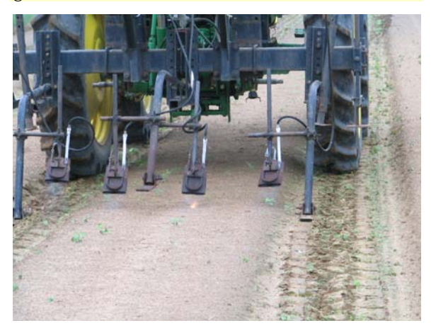
Figure 6. Broadcast flame weeder

Flame Cultivation. Broadcast flame cultivation prior to seeding the crop can be used effectively on most organically produced crops. It is more effective on a smooth soil surface than a rough or cloddy surface (Smilie et al., 1965). And it is more effective on broadleaf weeds than grasses, but its effectiveness decreases as weeds mature. Grasses and perennial weeds are most tolerant to flaming. Flaming burns grasses and perennial weeds to the soil surface, but sometimes these weeds are capable of regrowth. Seeding or transplanting crops after flame cultivation must be done carefully to prevent soil disturbance that can lead to weed seed germination and establishment.