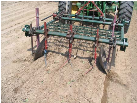
Figure 5. Flex-tine weeder with torsion rods

Flex tine weeders are effective on small weeds at the white-thread to cotyledon stage, whereas rotary hoes are effective at the white-thread to 2-inch stage for rotary hoe. The white-thread stage occurs just after weed seed germination when the radical or first root resembles a white thread. Weeds 4 inches or taller and grasses can tolerate cultivation with a flex tine weeder or a rotary hoe. (These tools may also be used after crop seeding if the crop is seeded deep enough to avoid seed disturbance or injury by the implement.) Tillage depth of flex tine weeders is easily adjusted by pressure on the tines or by using gauge wheels (see ww.hort.uconn. edu/weeds/htms/weeders.html). The speed of the rotary hoe affects weed control results because increased operation speed reduces soil penetration.