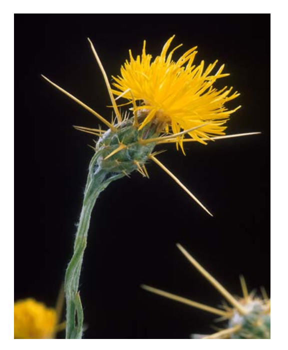
Figure 1. Yellow starthistle ( Centaurea solstitialis ).

This chapter describes weed control strategies for organic farms based on weed