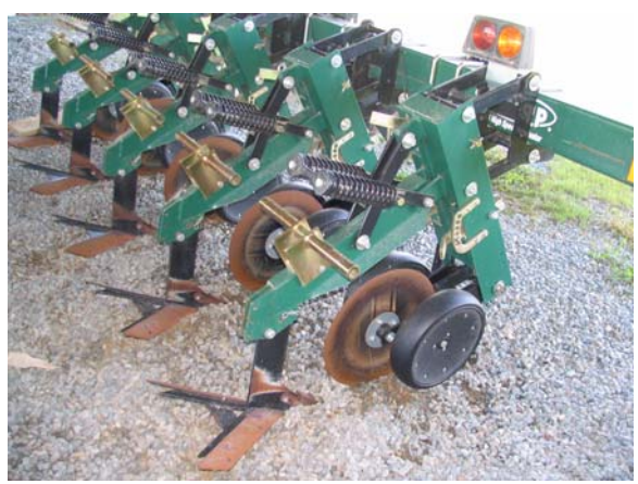
Figure 3. High residue cultivator