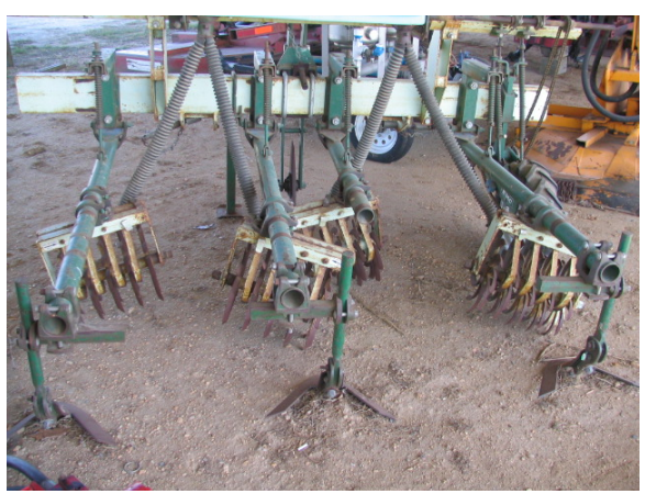
Figure 10. Rolling unit-two-row unit

Rolling cultivators. Rolling cultivators are aggressive and effective in controlling most annual and perennial broadleaf weeds. Rolling cultivators are not very effective, however, in controlling weedy vines or perennial weeds because their long stems interfere with proper turning of the rolling cultivator units. These weed species must be controlled when they are in the seedling stage. Rolling cultivators effectively control weeds near the crop row, and sweep cultivators are often used with rolling cultivators to control weeds between rows.