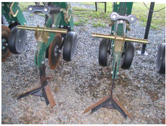
Figure 4. High-residue cultivator