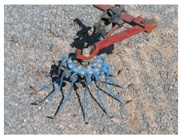
Figure 8. Flexible spider weeder

Flexible spider weeder. Spider weeders consist of a circular disk fitted with flexible wire fingers. They are ground-driven and are very effective in controlling weeds. Because crop stands are often reduced by this weeder, the crop must be established at above-optimum seeding rates when farmers use this tool. If crop stands are not optimum, using this weeder may result in low productivity. Flexible spider weeders must be used with a sweep cultivator to control weeds across the entire bed.