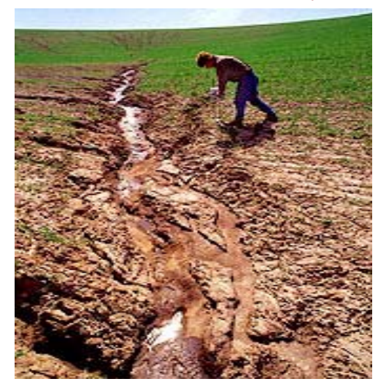
Figure 1. A soil scientist assesses the problem of soil erosion on a farm.

rules—that strives to mimic natural ecosystems in its focus on building soil health. In fact, to fulfill the many requirements for certification of a farm as organic, a farmer must establish a plan to improve soil