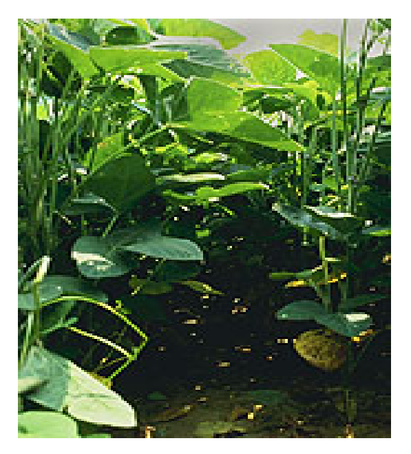
Figure 1. Soybeans are often part of an organic rotation schedule in the South .

For a variety of other reasons that we will explore in this publication, crops can and should be managed in rotations. No one disputes the fact that rotations are beneficial. The use of two- and three-year rotations by the majority of the grain farmers in this country shows they agree that yields are generally higher when crops are grown sequentially in rotations.