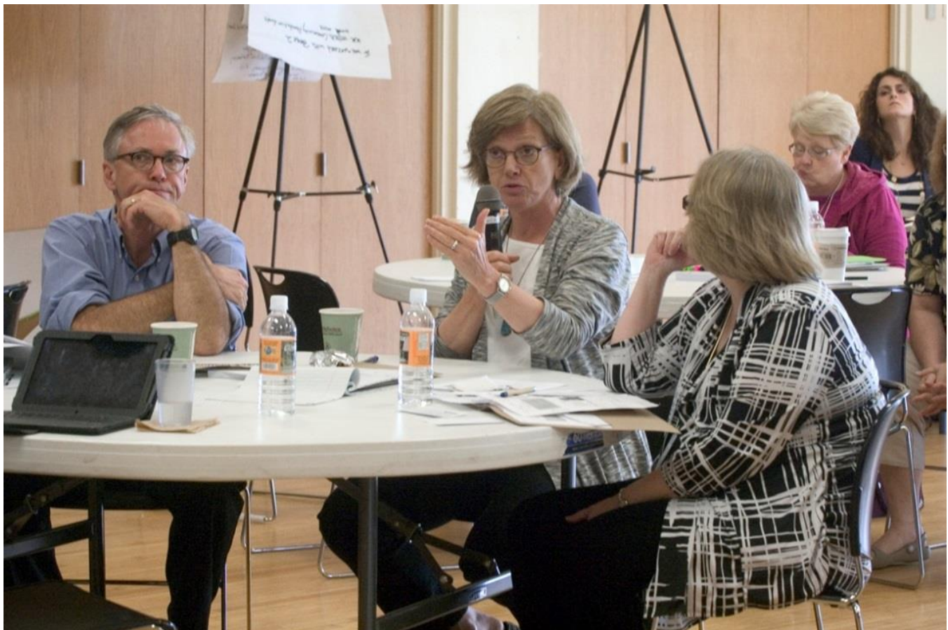
Panelists providing feedback to WealthWorks value chain practitioners at the Social Entrepreneurship Collaboratory, Berea, Kentucky, September 2013.

Livelihoods national community of practice—we focused chiefly upon helping WealthWorks value chains pitch their investment opportunities to targeted investors by applying specific skills for compelling business storytelling. In this paper, we aim to provide deeper insights into those parts of the landscape of stakeholder finance that appear most relevant to WealthWorks rural place-based value chains, particularly in the South. Our aim is less to provide a comprehensive survey of place-based investment resources than to provide high-level perspectives on the kinds of investors value chain enterprises should consider as they assess their investment readiness.