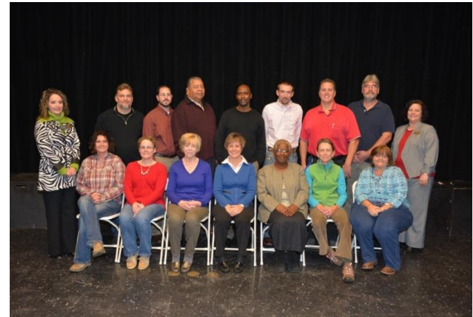
Graduates of the Vance-Granville REAL program

Vance-Granville SBC holds their course at the local farmer's market