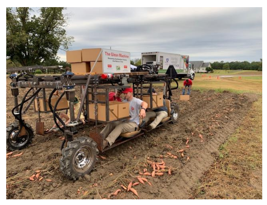
Figure 3: Harnett County Extension 4-H Gleaning Event.

A second event utilizing the harvest aid was the 2019 Harnett County 4-H Sweet potato Gleaning Event. Approximately 80 kids and adults participated in the event, gleaning over 18,000 pounds of sweet potatoes. All participants that wanted to use the Glean Machine were able to ride and harvest. At both events there were participants that would not have been able to harvest produce if not for being able to ride on the harvesting aid.