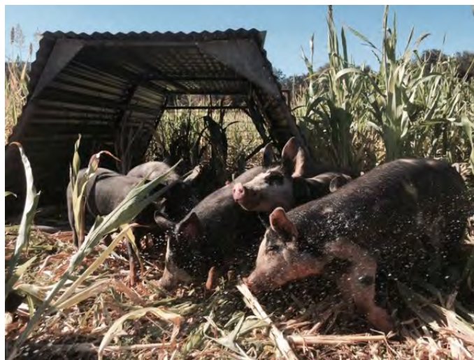
Pigs consuming corn.

Even with good planning, maintaining cover in high use areas is difficult. In outdoor hog production systems, bare soil is common where hogs congregate, for instance around feed and water sources, farrowing pens or pastures, traffic corridors and lounging areas.