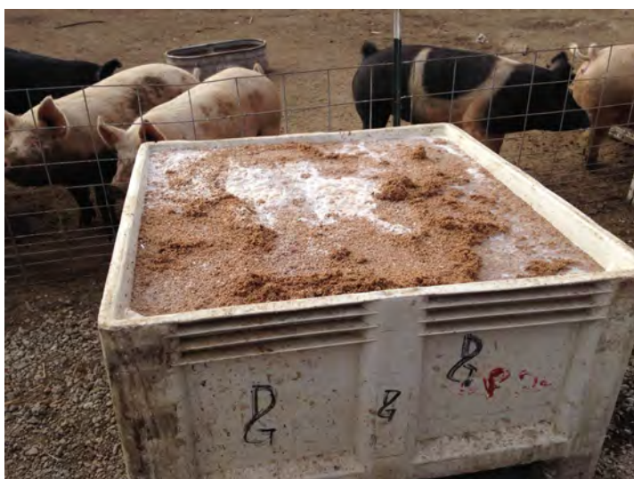
Brewers grains mixed with milk and whey.