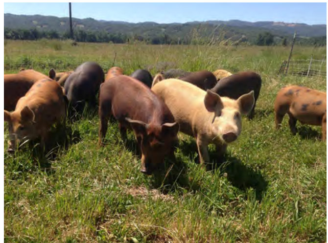
Pigs on perennial pasture.

very diverse mix of annual and perennial plant species. The vegetative growth cycle begins with fall rains and continues through the winter and spring months as long as there is adequate precipitation. By late-spring, herbaceous plants generally release their seed and die or enter dormancy during the summer months. Grazing is typically seasonal to coincide with the forage growth cycle and