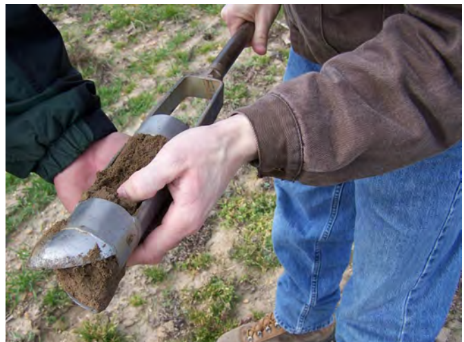
Soil sampling can assist with nutrient management.

Hog operations typically depend on a significant importation of feeds from off the farm. Any importation of feed also imports nutrients, some of which are retained in growing animals while the remainder is lost as un-utilized feed or excreted as manure and urine. Growing hogs will utilize about one-third of consumed feed for tissue development and energy while two-thirds will be excreted. Stender (2012) provides a good summary of feed efficiency for growing hogs.