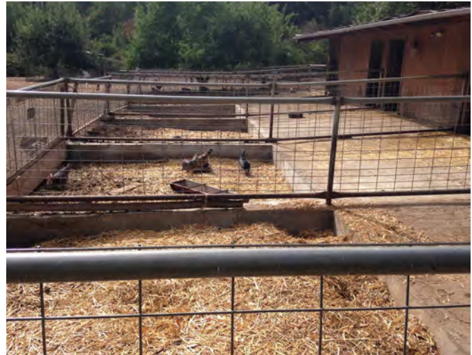
Farrowing area for sows.

If you will need a quarantine paddock, herd handling or sorting facility, consider where this infrastructure will be located and how roads and paths will work to promote easy and stress-free movement of animals. As a means of minimizing damage to soil and vegetation, fences should be laid on the contour when possible.