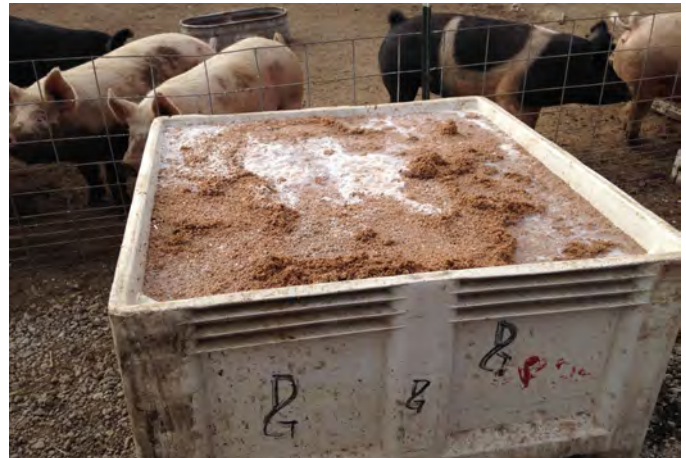
Brewers grain mixed with whey.

and conduct a resource inventory including forage resources (rangeland and pasture), trees, barns, groups of animals, soil, topography and water sources. A ranch map can be very useful in planning resource utilization and management. Your grazing system will need to match resource availability with animal needs, while adjusting stocking rates for forage, soil and climate conditions.