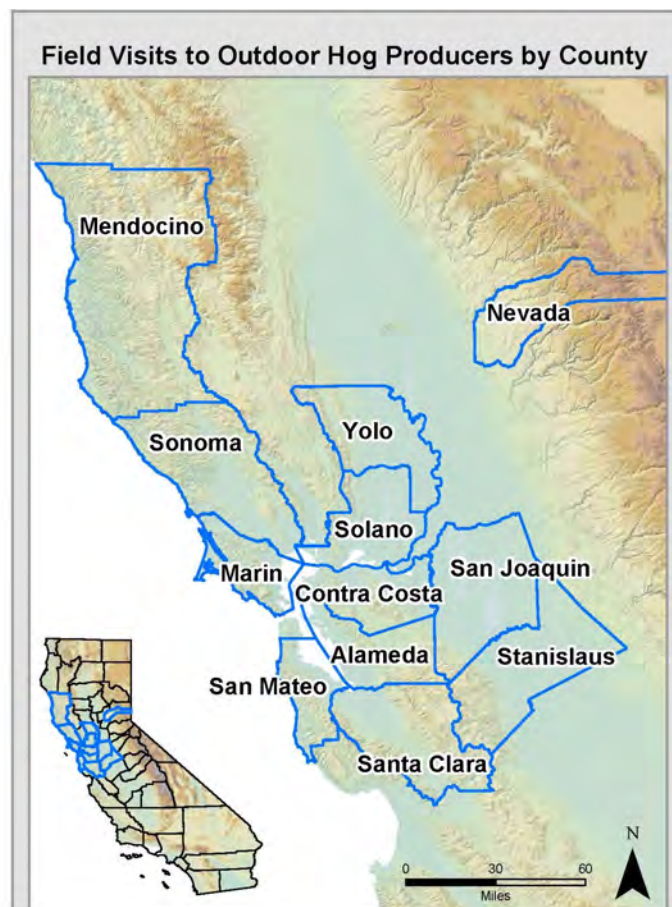
Figure 1 : Map of Field Visits to Outdoor Hog Producers by County

ecological niches characteristic of the study area, as well as from a diversity of production approaches. Detailed surveys were conducted at 10 of the 14 locations to better understand conservation and production challenges and successes.