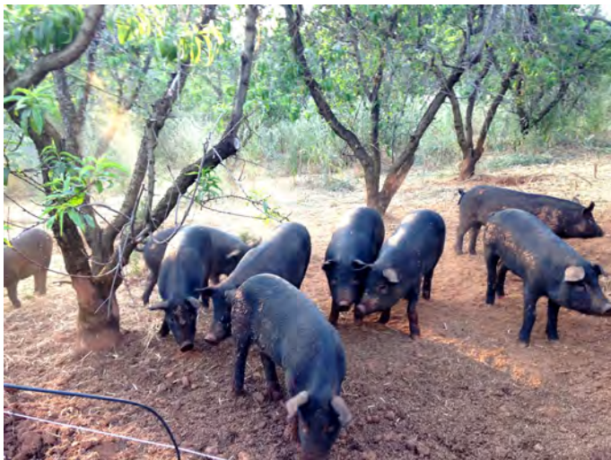
Hogs in an orchard.

Pasture & Rangeland Based: In a pasture or rangeland-based system, hogs are raised on pasture (irrigated or improved) or rangeland (dryland), where the consistent presence of vegetative ground cover is a key element of the production system. Though hogs are not ruminants, they will graze as well as root and trample, so careful management is required to ensure the maintenance of ground cover. In such systems, animals generally need to be moved (rotated) to preserve forage and enable recovery of high use areas. They typically rely on portable shelter, feed and watering infrastructure as well as cross-fencing to create multiple paddocks. In some cases hogs may be included in a multi-species rotation, wherein different livestock species are cycled through the same pasture to more fully utilize feed and provide improved nutrient cycling. For more information see the factsheet in this series on Rangeland and Pasture Management and Multi-Species Grazing .