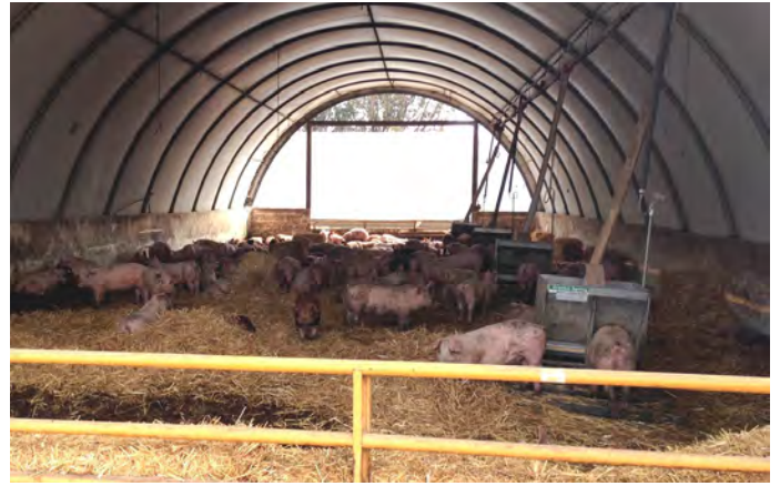
A deep bedded system. Photo courtesy of Long Ranch.

Drylot: Drylot systems are typically permanent, with fixed fencing and higher stocking densities. Though feeders and waters may not be permanent, they often remain in the same