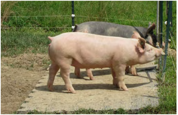
Slatted mat for drinkers.

Any type of livestock system will have congregation points where impacts will be very high relative to more extensively grazed areas. These heavy use areas are sometimes determined by humans when choosing where to locate water or feed troughs, as well as corrals, barns or other structures that cause animals to persist at high densities. Animals often favor locations with naturally occurring shade (trees), water (creeks or ponds) or feed (acorns or fruit). Congregation points are a necessary part of animal husbandry, but care should be taken to locate and manage them to minimize their corollary environmental impacts such as bare soil, compaction, and above-normal nutrient loads from manure and urine. One practice used by some producers to reduce impacts around feeding and watering sites is to locate the trough on a movable platform that is slotted or perforated. This allows water to drain to the ground, but prevents hogs from disturbing the soil.