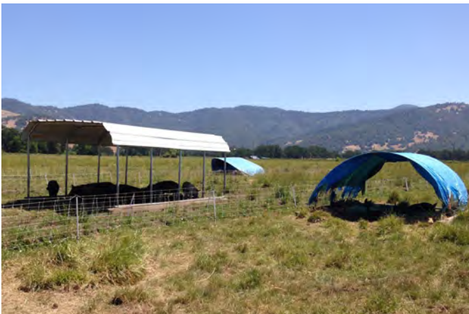
Portable shelters help minimize impact to pasture or range.

Weeds are a common problem in almost any agricultural system and can vary from being a mild nuisance to extremely noxious or poisonous. Compared to rangelands, irrigated pastures and drylots are more intensively managed or disturbed, have higher levels of nutrients, and may have more bare soil due to excessive water or animal use. Once established, weeds are difficult to control, let alone eradicate, because seeds can often persist in the soil for several years.