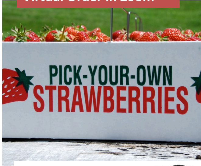
Virtual Order in Zoom